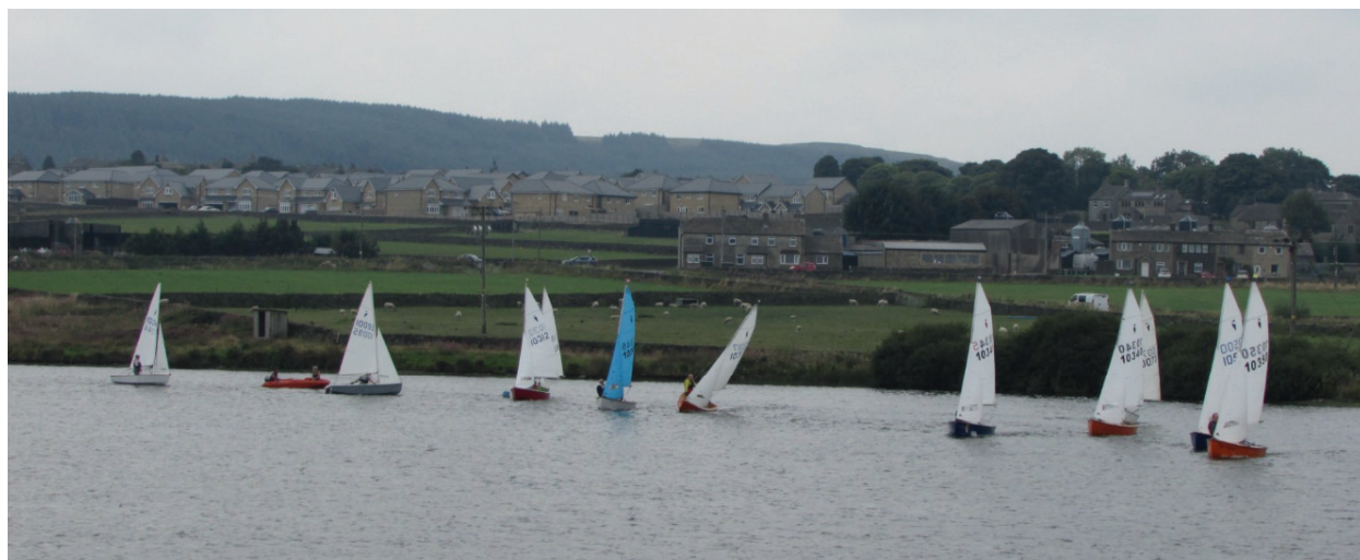
Heron Open Meeting Saturday, 3 September 2022